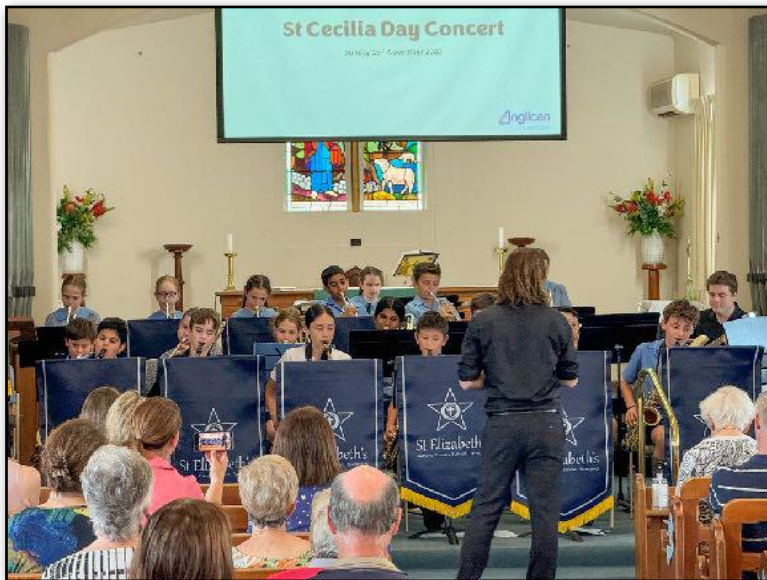
St Elizabeth's Primary School Stage Band

This year we were honoured to host the annual St Cecilia Day Concert featuring the musicians and choir of St Luke's and musical talent from the local community, and the performances were outstanding.