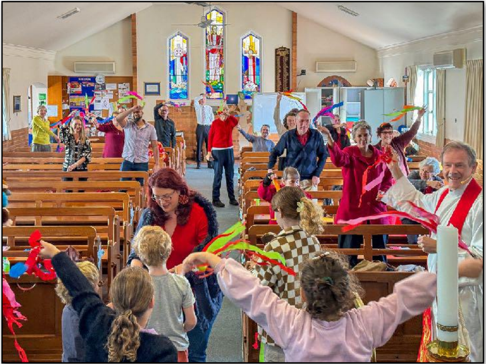
A riot of colours