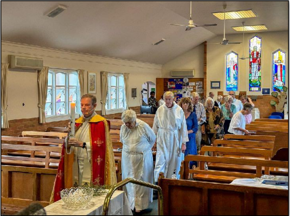
The Procession of the Paschal Candle

What joyous occasions were Easter and Pentecost services at St Luke's!