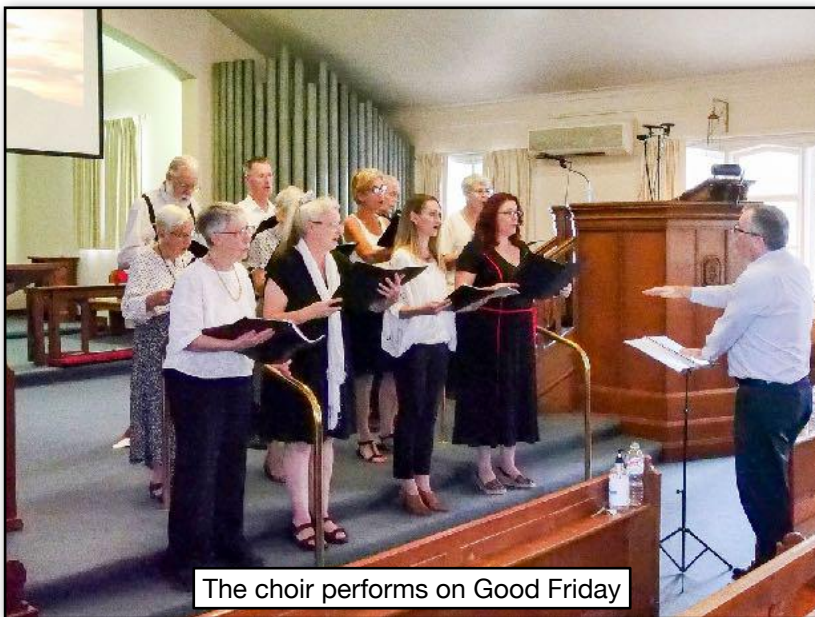
The choir performs on Good Friday

On Easter Day (31st March), the choir participated with a 'reflection' piece in the 9 am service with, 'Who is He, in Yonder Stall' composed by Benjamin Russell Hanby. This hymn refers to a number of phases of Jesus' life, so the choir selected those verses relevant to Easter Day. It was sung in in 2-part harmony by including a soprano descant.