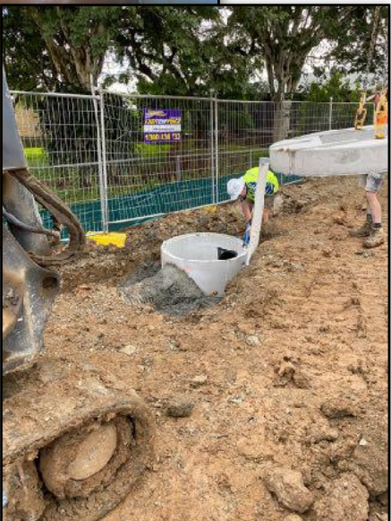
In-ground services going in

The inside of the Parish Centre has been stripped and the supporting piles repaired and cut down so that the house can be lowered into its new place. The rest of the site is being prepared for the new build, with in-ground services beginning to be installed.