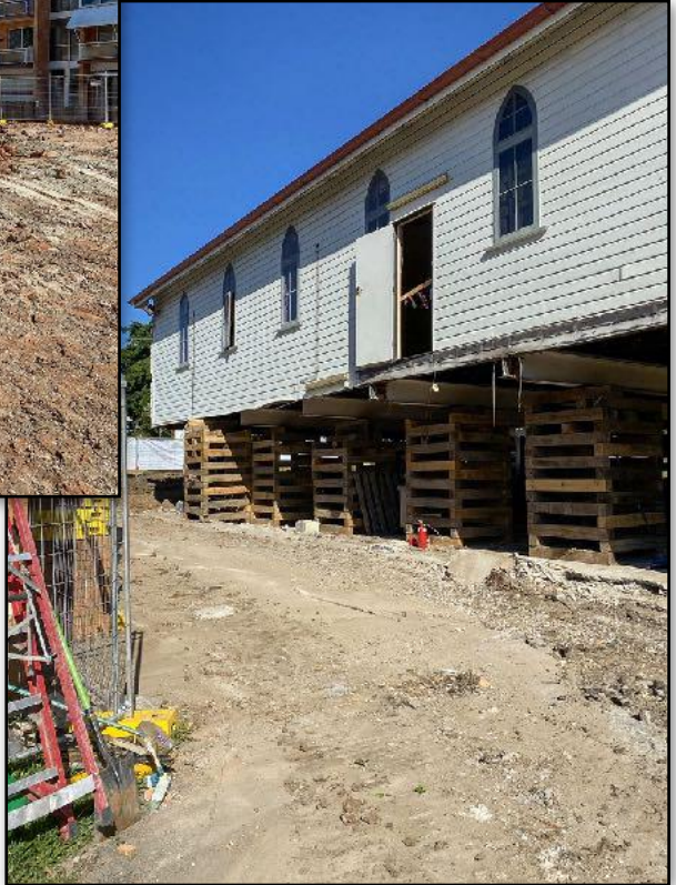
The Hall being prepared for moving

We have seen the hall stripped back to the footprint that it had when it was the original 1920's church and prepared for moving. It appears to be suspended on piles of Jenga bricks.