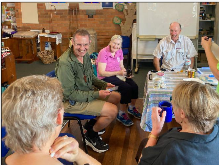
Time for a cuppa and a selfie