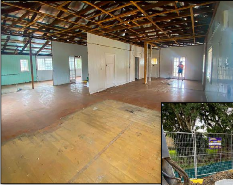
Stripping the inside of the Parish Centre

The inside of the Parish Centre has been stripped and the supporting piles repaired and cut down so that the house can be lowered into its new place. The rest of the site is being prepared for the new build, with in-ground services beginning to be installed.