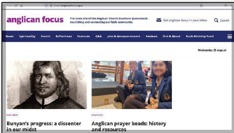
The Anglican Focus Website: anglicanfocus.org.au

Never has the need to communicate been more focused on the wonders of technology. The recent State lockdown prevented us even travelling across our own city. How our lives can shrink suddenly and we can become prisoners in our own small world. One of the reasons I like to receive the fortnightly Anglican Focus e-newsletter is that it gives me an insight into Anglican life. Not just that of our own Diocese of Brisbane (known as Anglican Church Southern Queensland), but a chance to reach out to the world.