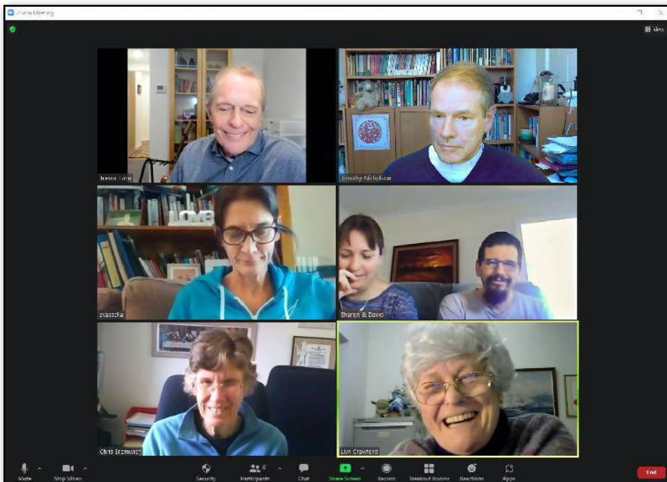
Our Last Meeting