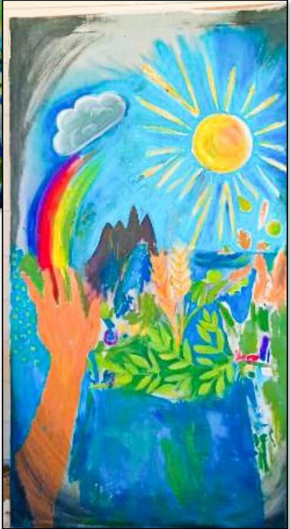
The completed canvas with input from all ages