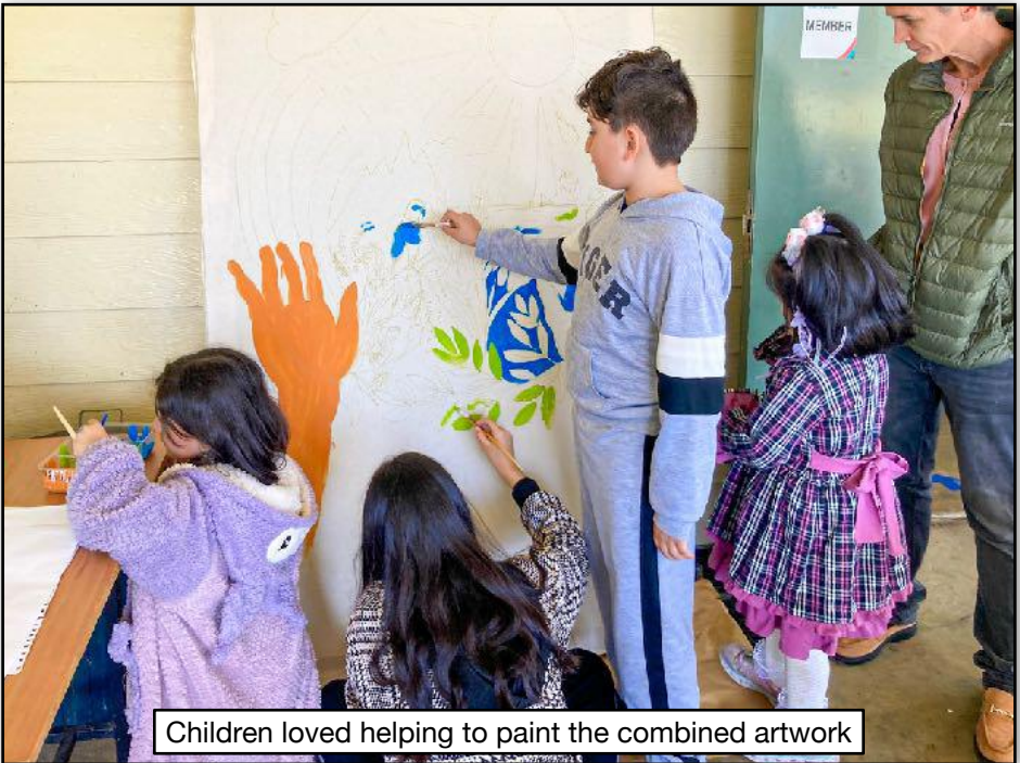
Children loved helping to paint the combined artwork