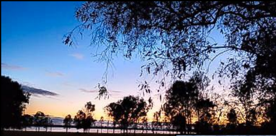
The evening light over Atkinson Dam was spectacular!