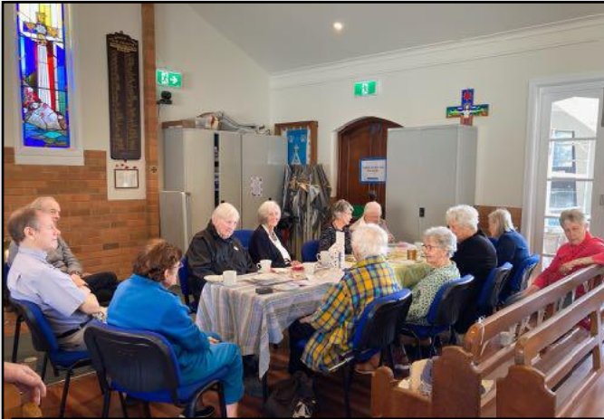
St Luke's Connect on 28 May: June told the story of the Mouseman!

St. Luke's Connect continued its last Wednesday of the month 9.30 am services and 10 am gatherings at the rear of the church- until July when the first gathering on our new church deck was possible!