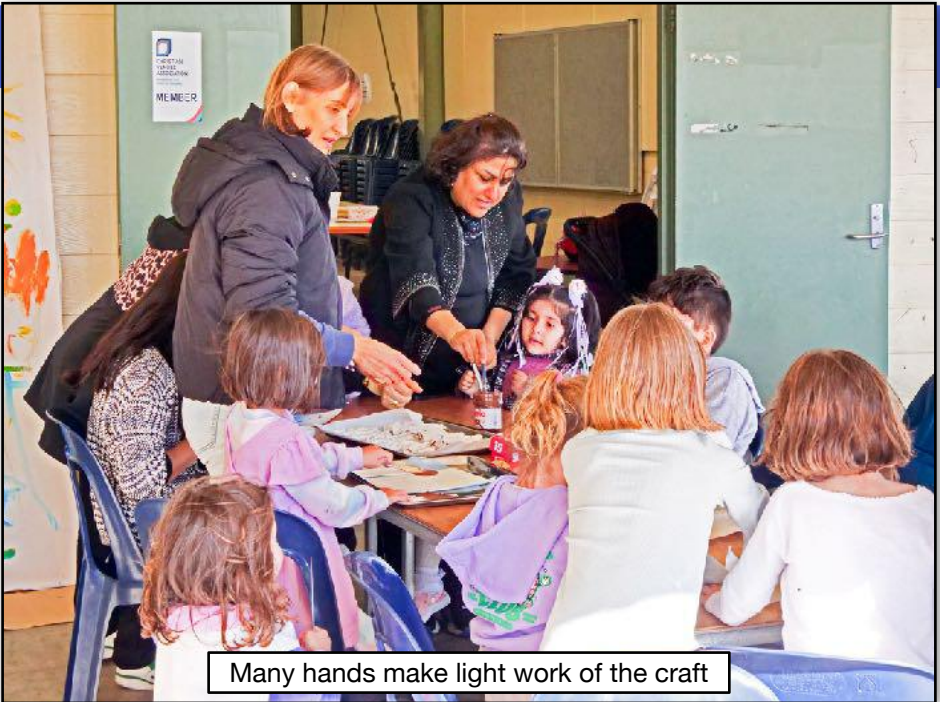
Many hands make light work of the craft