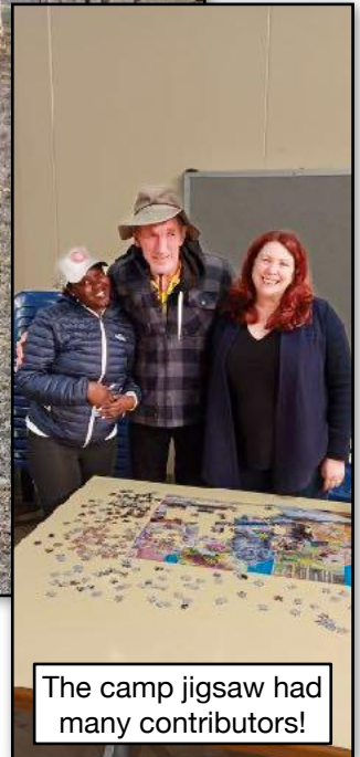
The camp jigsaw had many contributors!