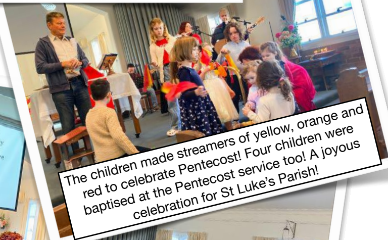
The children made streamers of yellow, orange and red to celebrate Pentecost! Four children were baptised at the Pentecost service too! A joyous celebration for St Luke's Parish!

Jesus loves me still today Living with me on my way Giving us a friend to give And love to all who live Jesus loves me Jesus loves me Jesus loves me The bible tells me so