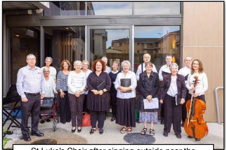
St Luke's Choir after singing outside near the Memorial Garden on 1 June 2025

a favourite of a number of your choristers, with its mysterious lyrics and gentle melody. The choir presented it in unison on the verses and 2-part harmony and descant on the refrains.