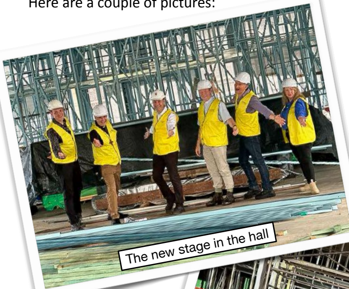
The new stage in the hall