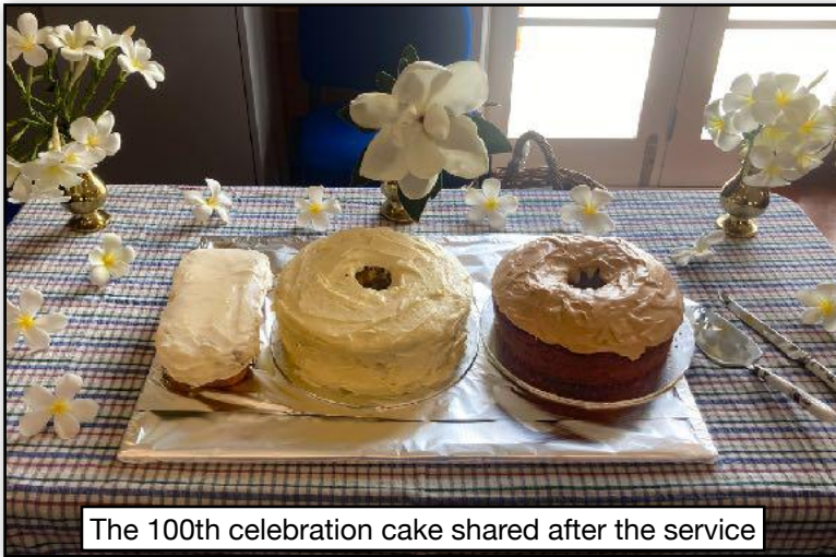
The 100th celebration cake shared after the service