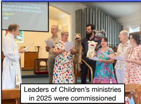
Leaders of Children's ministries in 2025 were commissioned