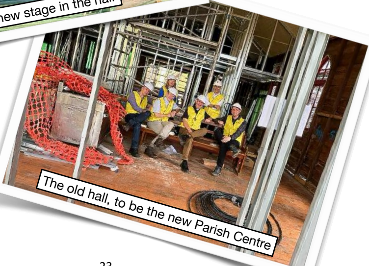
The old hall, to be the new Parish Centre