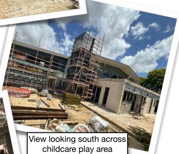
View looking south across childcare play area towards the new build.