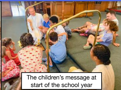
The children's message at start of the school year