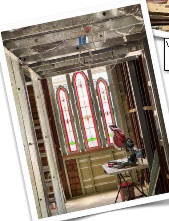
The original stained-glass windows from when the old hall was the church that we found as part of our final clean-up last year have now been reinstalled in the building to provide a link between the old and the new.