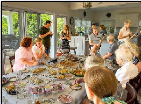
The choir enjoyed the wonderful spread

The liturgical year now moves into Lent in early March. The choir hopes to make some meaningful musical contributions to the worship services in this period leading up to and including Easter.