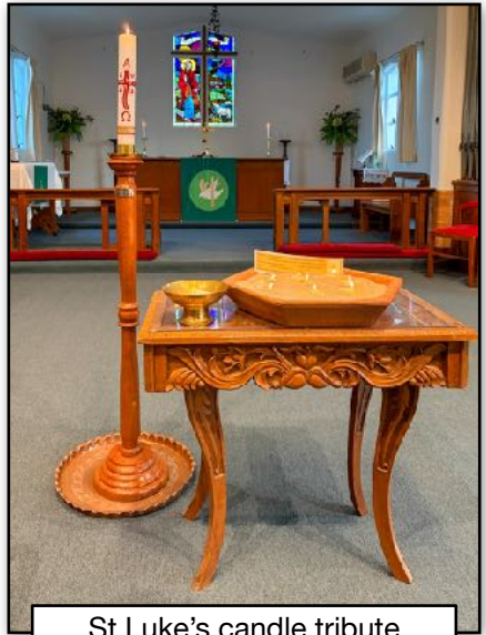
St Luke's candle tribute

St Luke's Ekibin held a special service of Evening Prayer on this day, all were invited and it was also available on Zoom. I was able to attend by Zoom this very moving service, a tribute to those whose innocent lives were taken, and those who mourn the loss of their family members, their friends and all members of the Jewish community. The service included inspirational prayers and music and the opportunity to light a candle, as the Prime Minister had encouraged all Australians, including those from all faiths, and none, to do on this day.