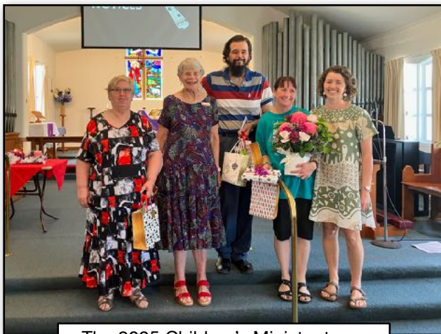
The 2025 Children's Ministry team