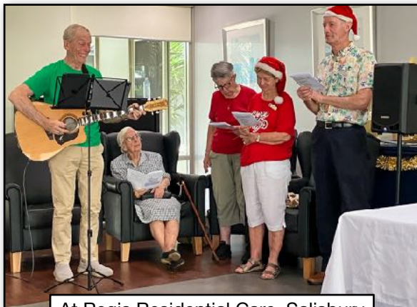
At Regis Residential Care, Salisbury