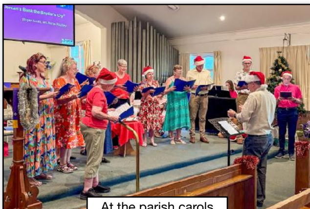
At the parish carols