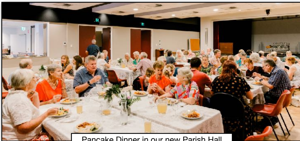
Pancake Dinner in our new Parish Hall

Tuesday 17 February was a significant date in the Parish calendar this year as it was when St. Luke's was able to celebrate Shrove Tuesday in style again by holding the Pancake Dinner in our new parish hall. This annual tradition has not been possible in 2024 and 2025 because of the redevelopment, so it was a special, happy occasion enjoyed by 55 guests.