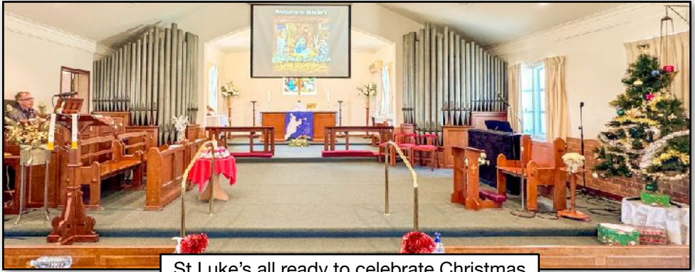
St Luke's all ready to celebrate Christmas

On Christmas Eve and Christmas Day our beautiful church looked splendid, with Christmas tree, crib, and specially prepared, beautiful floral decorations prepared by Alison, all ready for the three services celebrating Christ's birth with the inspiring readings, music, prayers and hymns!