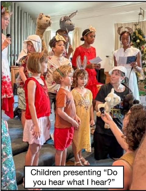
Children presenting "Do you hear what I hear?"